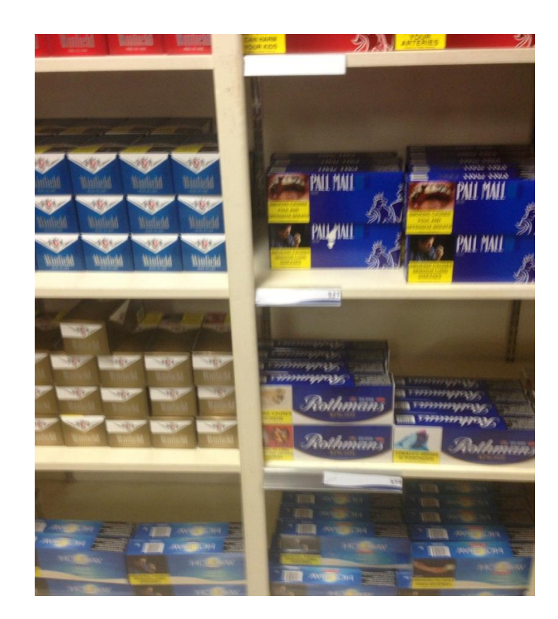
Duty-free shop at Rarotonga Airport, Cook Islands

P: "...about seven people last year around Xmas, who actually started smoking again because the people from Tonga bought all these duty-free smokes when they came for holidays.. there was so much abundance around them at faikava...they couldn't help themselves.