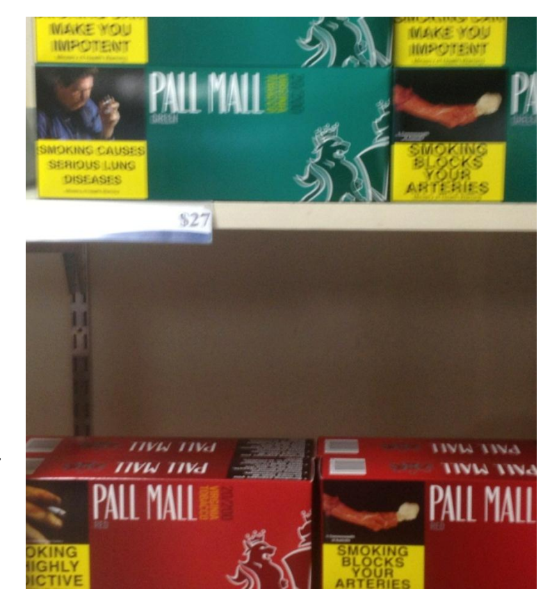
Duty-free shop at Rarotonga Airport, Cook Islands

"...easily available, easy to carry, always welcome, long-lasting, don't need to think about it, can be a last minute purchase, and are relatively cheap if purchased duty free"