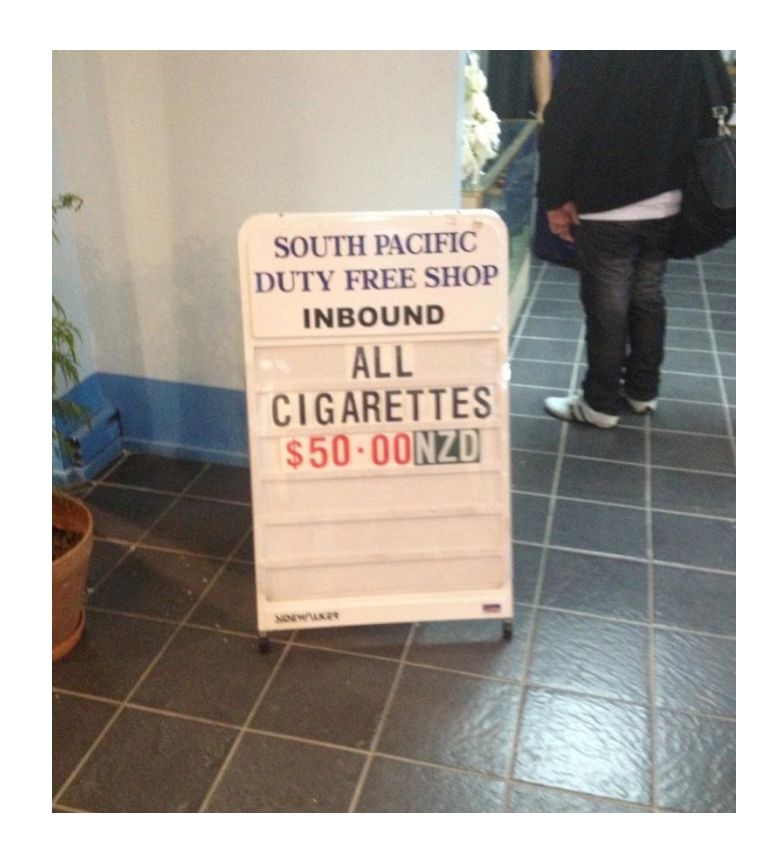
Duty-free shop at Faleolo Airport, Western Samoa